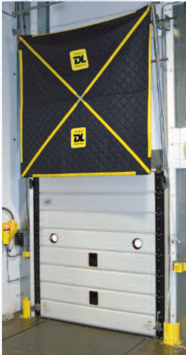
The Leveler Blanket™ conveniently stores up and out of the way.

Be sure to check out our website for other GREEN products by DL Manufacturing.